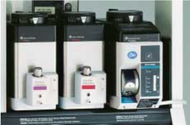
The Tec 6 Plus interlocks in series with Tec 5 and Tec 4 Vaporizers on the Datex-Ohmeda Selectatec® backbar